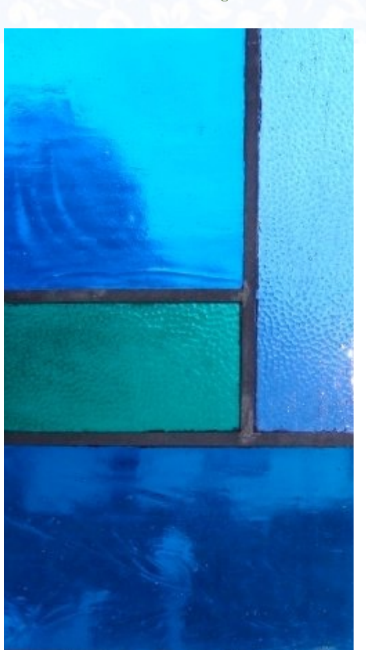
What can you expect?